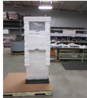
Merchant Max Before Box

You will then be left with the kiosk on the pallet like the picture above. Remove the box and protective wrapping on the kiosk.