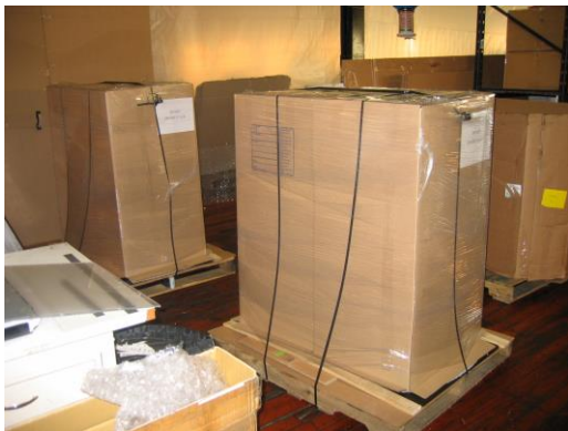
Two Merchant Max On Pallet

The Merchant Max is always shipped on a pallet that will look like the picture below. Remove the plastic wrap and the straps around the box.